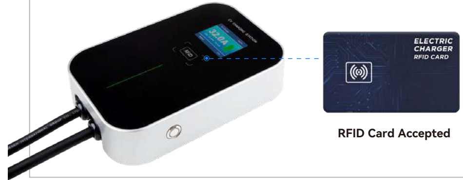
RFID Card Accepted